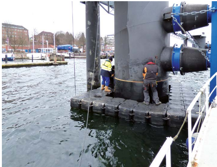
Workers are applying MarineProtect® in the harbor of Kiel, Germany.

compound. The tape is highly flexible and mouldable and can be easily applied to any shape of surface. When the tape is wrapped spirally with a 50% overlap over the primer-coated surface, the water is displaced and a chemically resistant against salt water casing is formed which is impermeable to corrosive media such as oxygen and water. The tape is also highly acid resistant to media with a pH value of 0 to 14. The MarineProtect®-Jacket is the top layer of the system and serves to protect against mechanical damages from waves, flotsams, ice loads and high winds. The jacket is made of highly durable, UV-resistant high-density polyethylene (HDPE). It is resistant to media with a pH level from 0 to 14, UV radiation, flexible, non-toxic, yet highly durable. The jacket of MarineProtect®-2000 FD is fixed with stainless steel bolts while for the fixation of MarineProtect®-100 Jacket special glass fibre reinforced polyamide tension SmartBand straps are used.