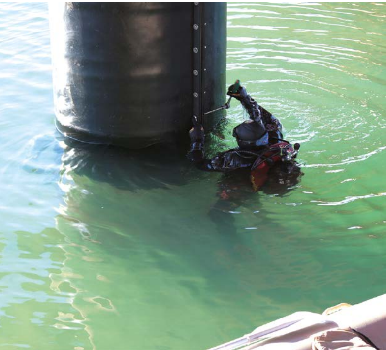
The application of MarineProtect®-2000 FD Jacket.